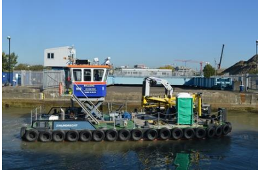
Bulldog multicat working on the Thames

Originally built in 1999 in the Netherlands, the Bulldog is a bars multipontoon, able to tow and push, fetch and carry. The Bulldog is also equipped with a Palfinger PK32080 marine crane with a 3.5 ton winch.