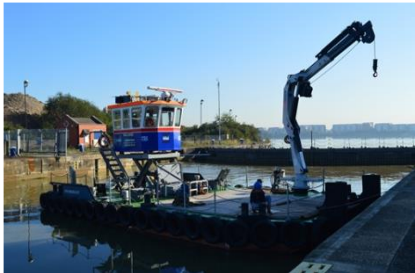
Bulldog multicat utilising her crane

Generator sets - John Deere 4045TFU70 230/400 V