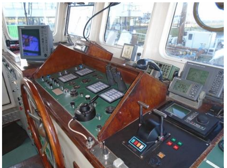
Hound Dog Wheelhouse