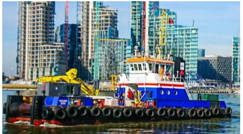
Hound Dog Multicat - newest addition to our fleet

The Hound Dog was built in Damen Shipyards in Hardinxveld, Netherlands in 1990 and originally named DMS4004 for Damen Marine Services. She was purchased and brought over from Holland by CPBS Marine Services in January 2017.