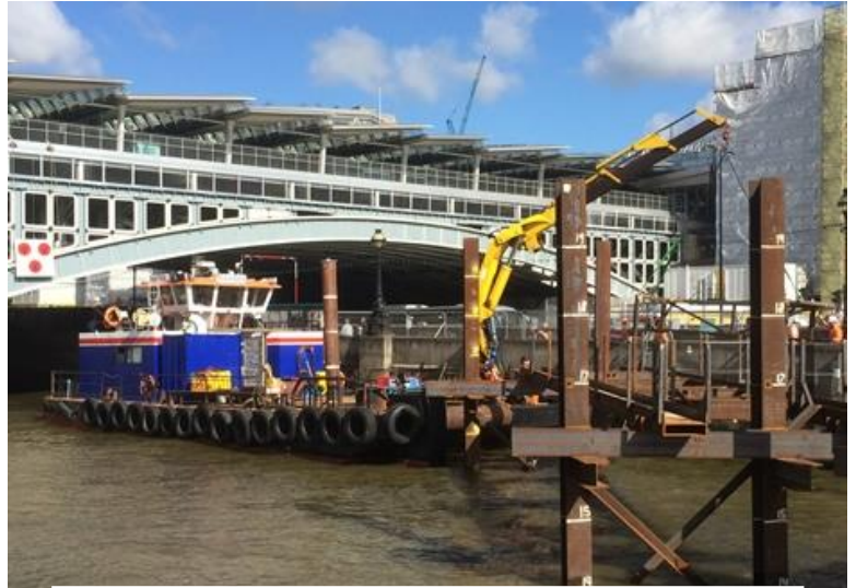
Seadog working on the Thames July 2016

Inside the large chart table area provides ample space for survey equipment.